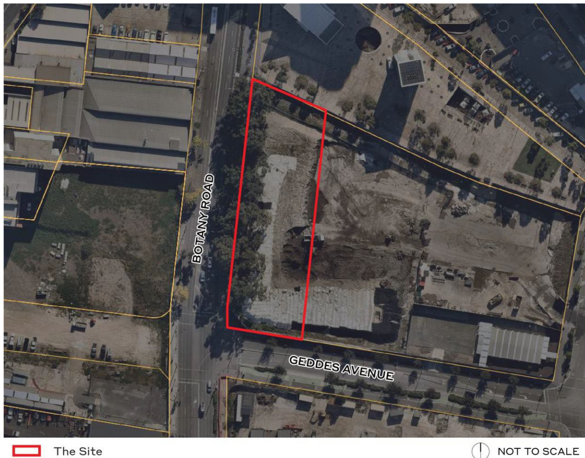
Figure 1 Aerial image of GSTC Sites 8A and 8B (377-495 Botany Road, Zetland)

The site is legally described as Lot 11 DP1199427. An aerial image of the competitive process site is shown in Figure 1 .